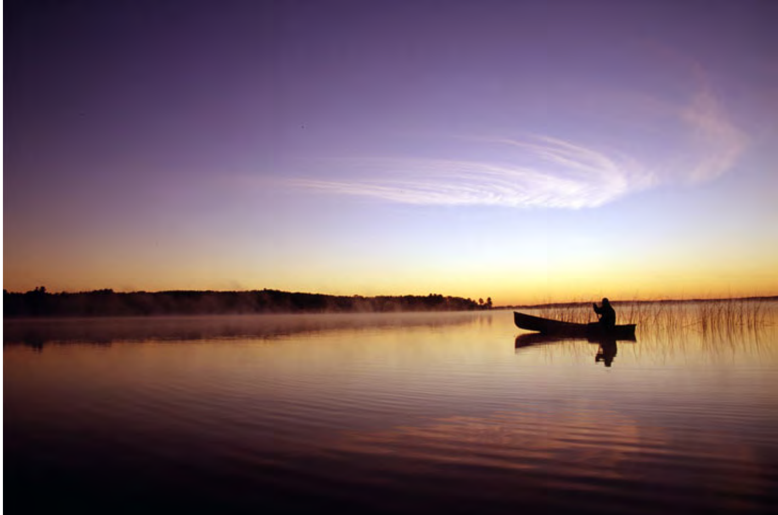
Canoeing on Crooked Lake near Petoskey