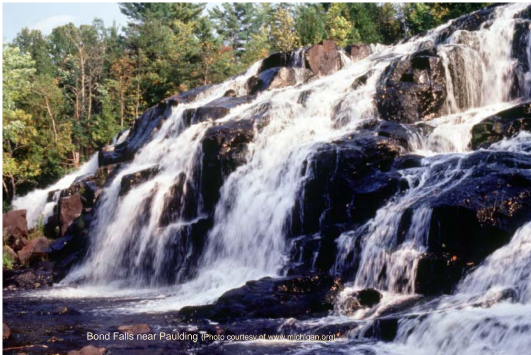
Bond Falls near Paulding

The MCC is a statewide, broad-based partnership that strives to include all interested public and private organizations and provides a forum for collaboration (communication, coordination, and the sharing of resources) to reduce the burden of cancer among the citizens of Michigan by achieving the Consortium's research-based and results-oriented cancer prevention and control priorities.