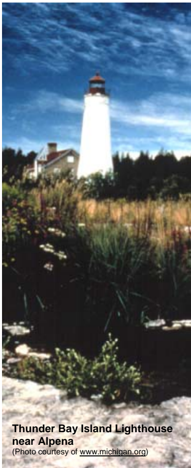
Thunder Bay Island Lighthouse near Alpena